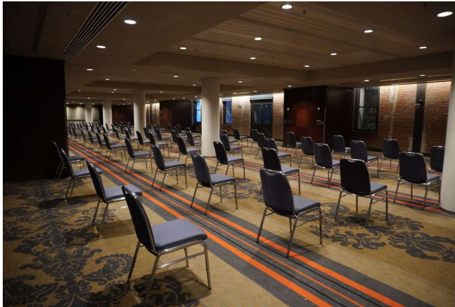
Laneway Rooms Theatre Style