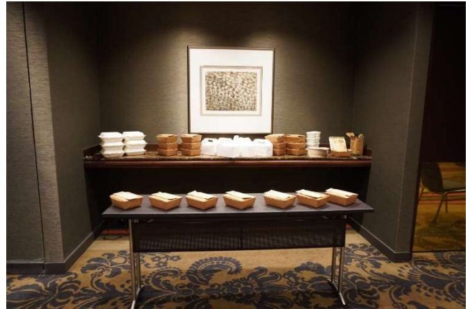
Sample Catering Station